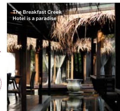
The Breakfast Creek Hotel is a paradise

8PM From the moment you climb up the lantern-lit pathway to the vast wooden door that marks the entrance to Tamarind Hill -- after which you're ushered to an outside table near a babbling brook -- it's as if you're world away from the city, despite the fact you're just a few metres from a busy thoroughfare. This gorgeous space is filled with antiques from Myanmar and Thailand, the same countries that inspire the food. Try the deep fried cod served with tender cabbage and carrots (RM40/