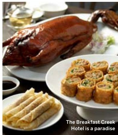
The Breakfast Creek Hotel is a paradise