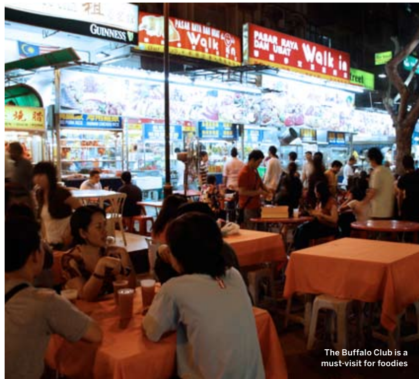
The Buffalo Club is a must-visit for foodies