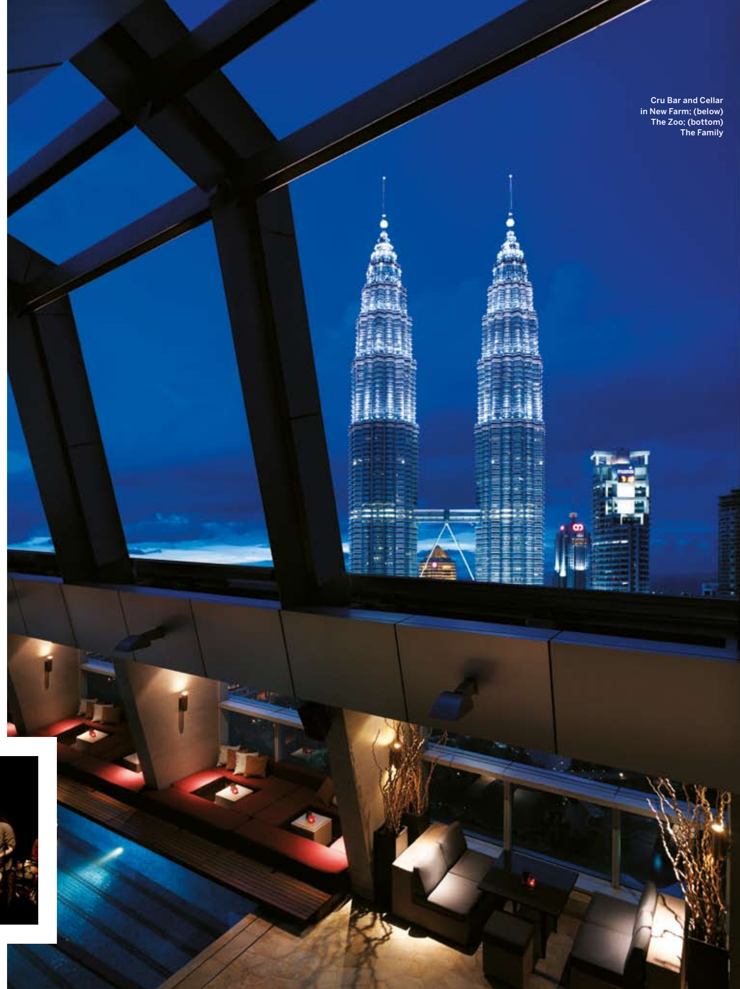
Cru Bar and Cellar in New Farm; (below) The Zoo; (bottom) The Family