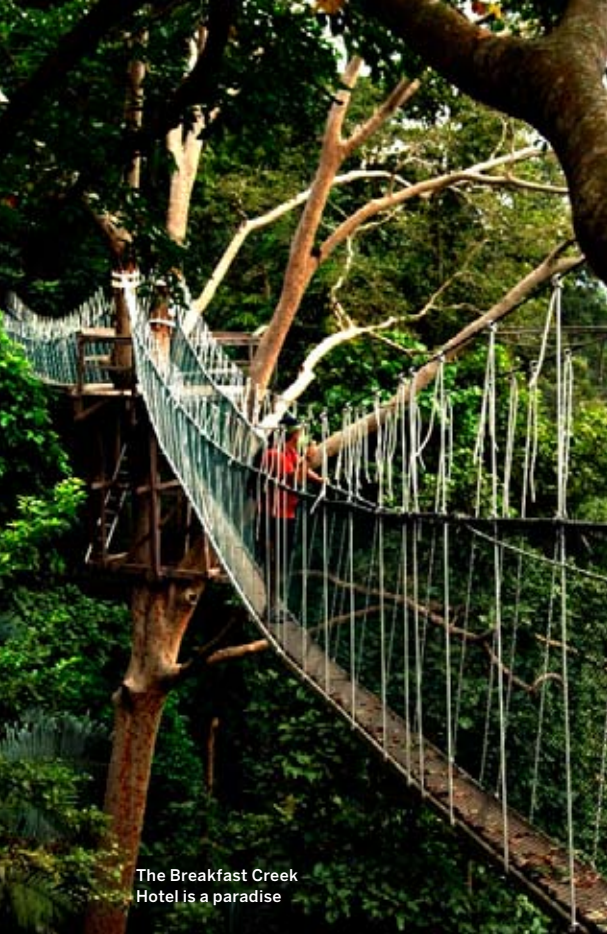
The Breakfast Creek Hotel is a paradise