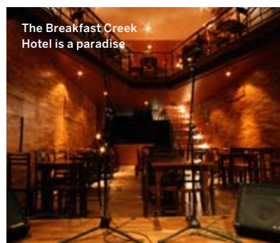
The Breakfast Creek Hotel is a paradise

11PM After the raucousness of Jalan Alor, finish your evening at the low-key and laidback No Black Tie , just a five-minute walk away. This atmospheric little Japanese restaurant and bar doubles as one of the best places to hear live music in KL, from smooth and serious jazz to show tunes belted out by drag queens.