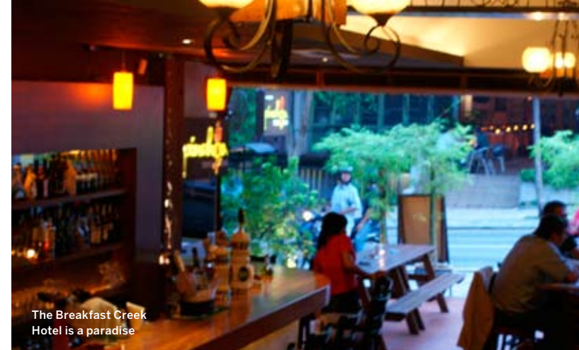
The Breakfast Creek Hotel is a paradise