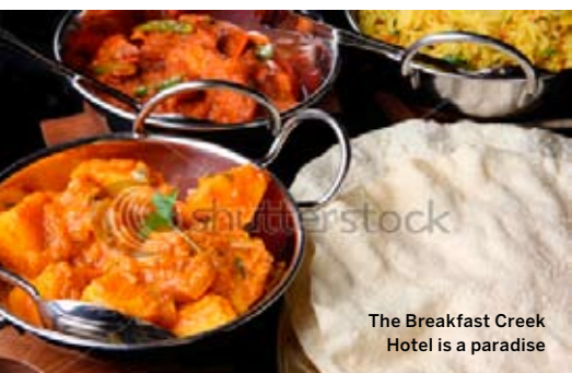
The Breakfast Creek Hotel is a paradise