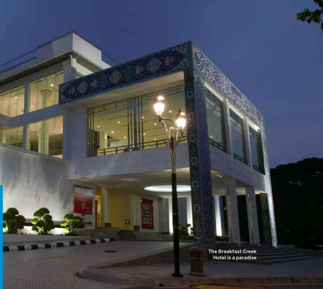
The Breakfast Creek Hotel is a paradise

3 Decadence is on the menu if you choose to have afternoon tea at Carcosa Seri Negara , the former residence of the British Consul which is now a luxury hotel. Take a seat in the original drawing room where white-gloved butlers serve up authentic English afternoon tea, complete with scones and cucumber sandwiches (RM60/S$25/A$XX), or try the Malaysian version (RM65/S$28/A$XX) with dainty sticks of satay and traditional kuah cakes. Available from 3pm–6pm. Taman Tasik Perdana, tel: +60 (0)3 2295 0888