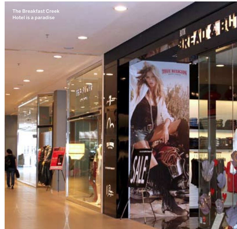
The Breakfast Creek Hotel is a paradise

duck are a feast for the eyes and taste buds.