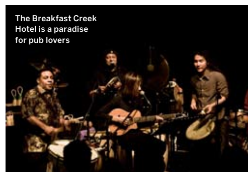
The Breakfast Creek Hotel is a paradise for pub lovers